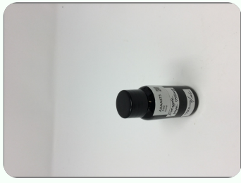
The photos on this report are of a sample collected by the lab and may vary from the final packaging.