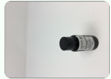
The photos on this report are of a sample collected by the lab and may vary from the final packaging.