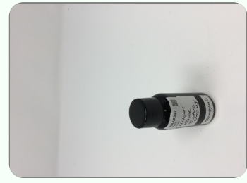
The photos on this report are of a sample collected by the lab and may vary from the final packaging.