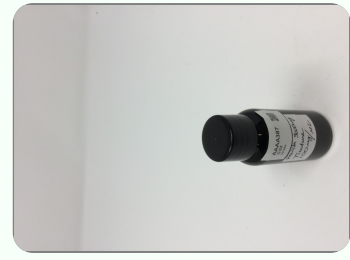
The photos on this report are of a sample collected by the lab and may vary from the final packaging.